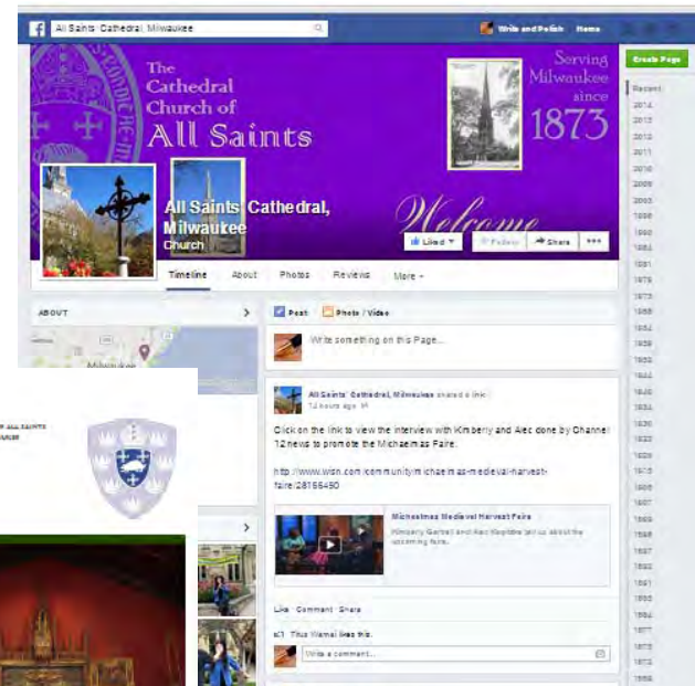
CATHEDRAL CHURCH OF ALL SAINTS THE DIOCESE OF MILWAUKEE

arcu massa molestie venenatis ut amet lacus. Donec gravida, orci quis nunc vestibulum, nisi in facilis nulla, at venenatis massa magna sed massa. Morbi faucibus metus nisi, a blandit ante. Donec quis libero a dolor condimentum convallis quis in justo. Integer id tincidunt erat. Duis eget massa vel quam molestie gravida. In consectetur lacus vel dolor rhoncus vitae crossauctor mi porttitor. Aliquam et