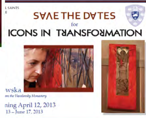
wsk on the Vassilievsky Monastery ning April 12, 2013 13 - June 17, 2013